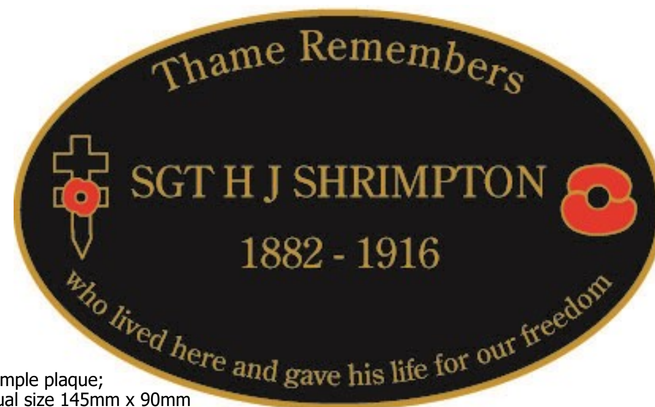
Example plaque; actual size 145mm x 90mm

Currently 96 suitable names have been identified; of which 72 are single name plaques and 12 are double name plaques. The locations for the plaques are spread around the older parts of Thame.