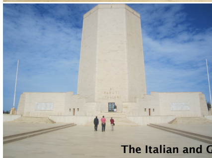
The Italian and German Mausoleums