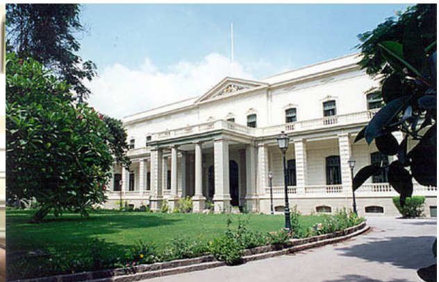
Tea at the Ambassador's Residence