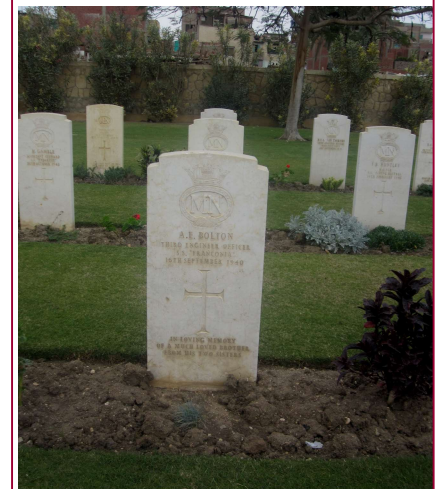
Clipped shoulders of Non-combatant Merchant Navy Graves