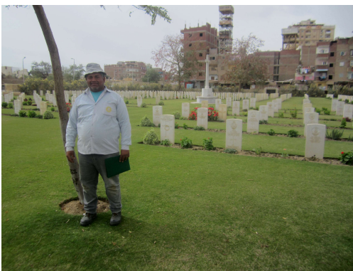
The Gardener at Suez Cemetery

The gardener came out to greet us with the register, beaming with pleasure that someone had come to appreciate his efforts. He is